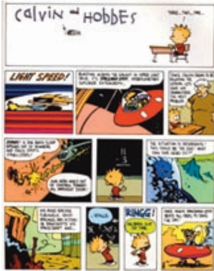
Calvin & Hobbes

Krazy Kat, Pogo, Peanuts, Calvin & Hobbes